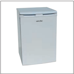
Racitor (140 l) Cod 025 010 070 010 (55 x 61 x 84 cm)