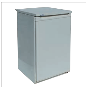
Frigider ARCTIC (180 l) Cod 025 010 070 020