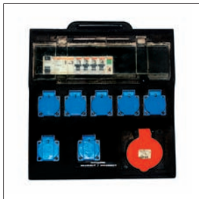
Panou Electric 380V/220V Cod 019.010.265.000