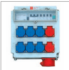
Panou Electric OCTANORM Cod 019.010.275.000