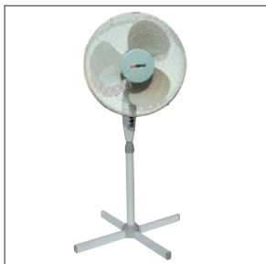
Ventilator cu picior Cod 025.010.500.020