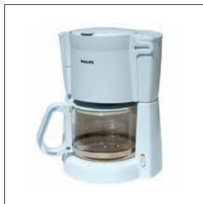
Filtru de cafea Cod 025.010.120.010