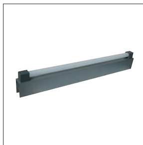
Corp fluorescent tip SS30 cu un tub D-170 Cod 019.010.190.000