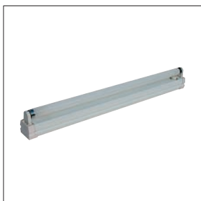
Corp fluorescent tip SS30 cu un tub D-170 - A Cod 019.010.190.001